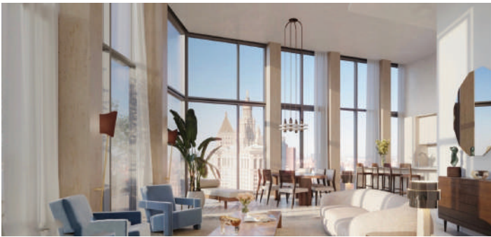
New York, New York

NEW YORK | LONDON | FRANCE | MIAMI | SPAIN | ITALY | THE HAMPTONS SANTA BARBARA | SAN FRANCISCO | PORTUGAL | DUBAI | FORT LAUDERDALE LOS ANGELES | ASPEN | SINGAPORE